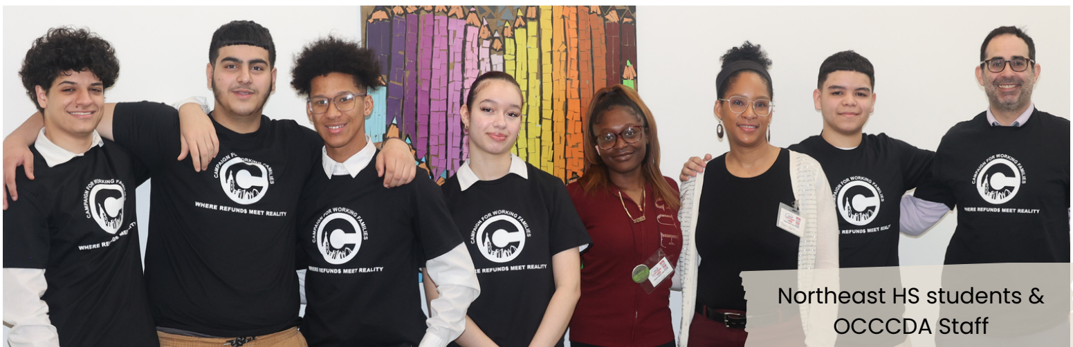
Northeast HS students & OCCCDA Staff

OCCCDA Mon: 4pm - 8pm Tues-Thurs: 10am -4pm Sat: 9am- 2pm